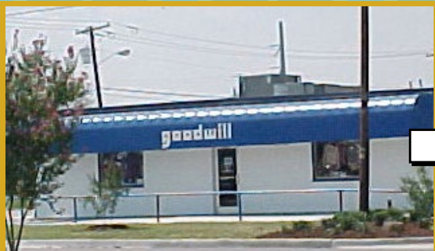
Store 6 - Waco, TX - Before Remodel