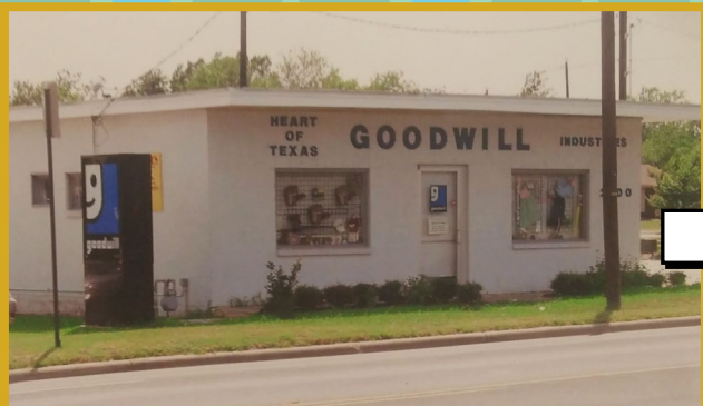
Store 17 - Bryan, TX - Old Store