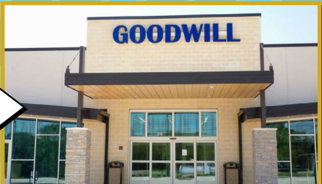
Store 19 Grand Opening