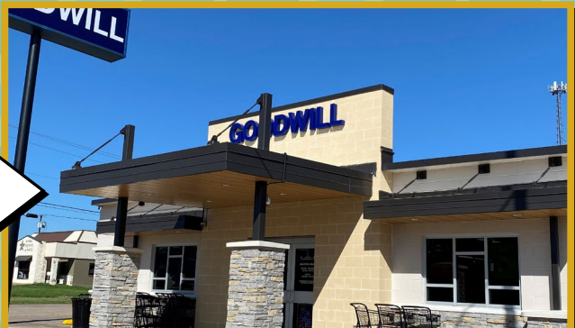
Store 6 Grand Re-Opening

Heart of Texas Goodwill Industries' First Annual Gala